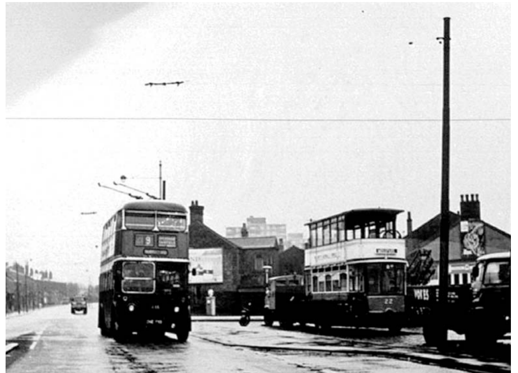
•Trafalgar Square as it once looked. Some things have changed, but we recognise the 219 bus and the puddles.

Then we come to Oxford Park and this was (and still is) a very well-liked park. The tennis courts were always in use, as were the bowling greens. Opposite the park were large "stately houses" all along (there was no garage or old