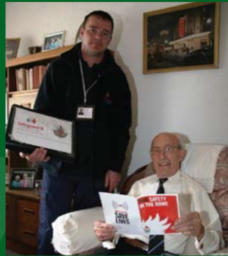
Safeguard It, delivering free, impartial home safety advice to the community.

This enterprise won a national award recently in the Fire and Rescue Service Equality and Diversity Awards and in its first year has been instrumental in creating a massive 40% reduction in domestic fires across the ward! This innovative enterprise has certainly influenced the mainstream as it is now being rolled out over a wider area and eventually will become national best practice. If you live in St Peter's ward and would like to make an appointment for your free home assessment, call us now on 0161 214 8300.